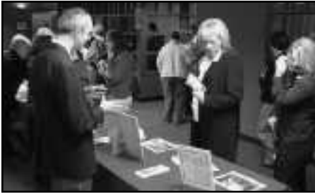
MegaResource School Librarian Workshop attendees network and explore resources for their libraries.