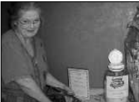
A Flowood customer during intermission purchases a $1.00 dollar ticket for the Friends the Library spring raffle. The winner of the raffle won over $1,700 worth of merchandise from area businesses. Proceeds benefit the Flowood Library.