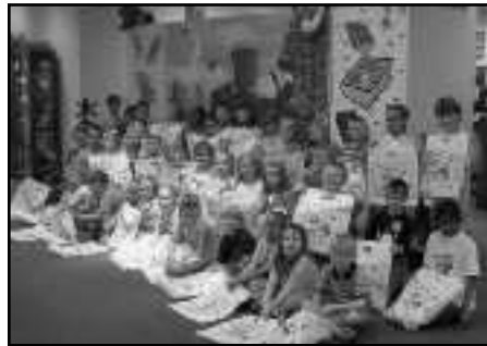
Clara Elementary School students with their National Library week bags at the Waynesboro-Wayne County Library.