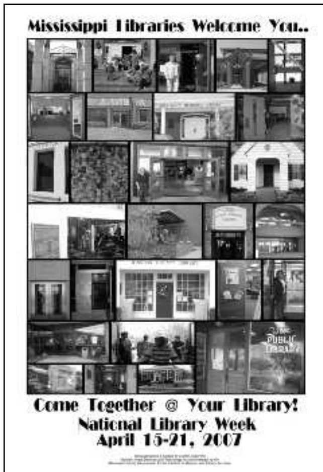
Poster for the 2007 National Library Week.