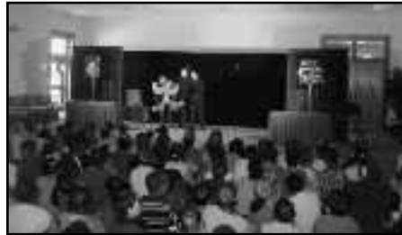
The Puppet Arts Theatre performed “A Carnival of Animals” at the Waynesboro-Wayne County Library.

The library also had a visit from students at Clara Elementary School. Each student received a commemorative National Library Week bag as part of their visit.