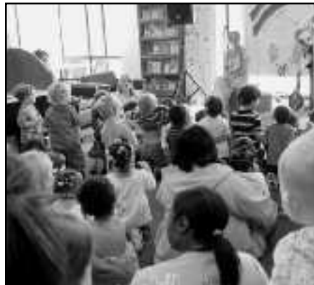
Mr. Watermelon Head and Paula Popcorn entertain children for National Library Week at the Delta State University Library, Instructional Resources Center.

The Instructional Resources Center (IRC), Roberts-LaForge Library, Delta State University (DSU) sponsored two events: