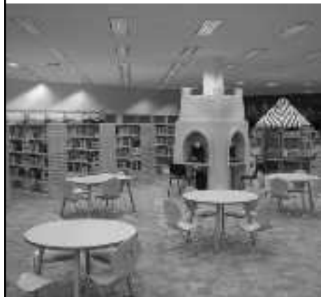
Dunedin Public Library