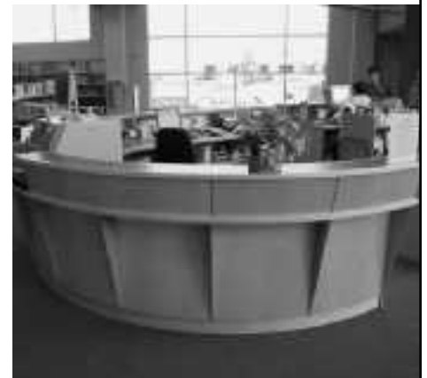
Wagner Branch Library

GN Associates, Inc. 1349 Lakeshore Drive