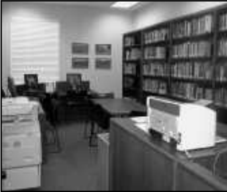
New Orleans Learning Resources Center.