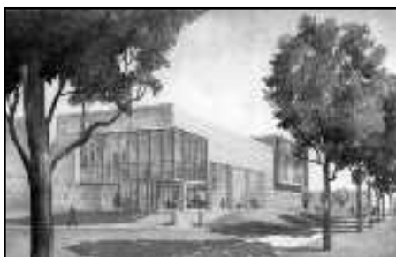
Forthcoming James H. White Library.

James Herbert White Library Mississippi State Valley State University