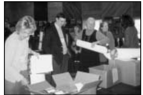
Legislative Day participants browse materials on the Glory of Baroque Dresden exhibit.

Librarians, trustees, and Friends gathered again that evening at the Eudora Welty Library to welcome legislators to the annual legislative reception. Over 100 legislators and officials attended this year's reception.