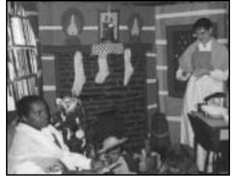
A Colonial Christmas is portrayed by the Hancock County Home School Association on Candy Cane Lane.

A community tree lighting seemed just the event that would bring people together. The idea expanded to include school choirs for entertainment, an indoor tree decorated by the children of the community, refreshments and a visit from Santa Claus. Representatives of the library's funding authorities participate with their families, and scores of volunteers contribute their time to the event.