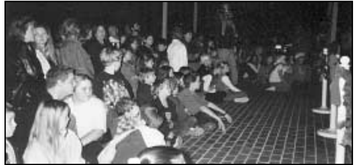
Hundreds wait outside on the plaza for the tree lighting program to begin.

designed a "candy-cane lane" through which the children walk. Along the lane, the home schoolers depict scenes from Christmas past. Songs and readings from Christmas stories entertain children in line. The library's mascot Louie the Alligator and his friend Boomer the Dog perform antics to the delight of the children. Hare Krishna Food for Life volunteers prepare five hundred cookies made from wheat grown and milled in Hancock County. A local businessman donates his time, his employees and his equipment to transport a fifty-foot tree to the site and decorate it. The volunteer fire department prepares bags with small toys and candy for Santa's Cub Scout elves to give each child.