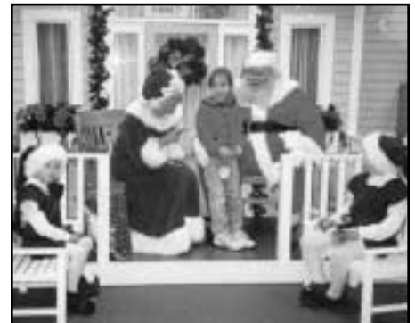
Santa, Mrs. Claus and the elves visit with each child and hear their wish list.