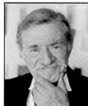
Ezra Jack Keats