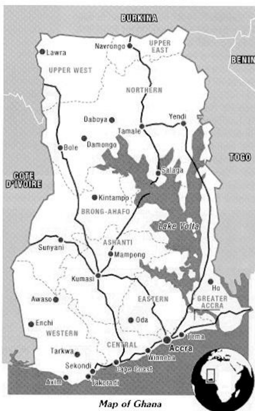
Map of Ghana

that it flows from doing and feeling as well as thinking. I am convinced that being a professional librarian has given me the opportunity to "risk going too far," and the journey has been most rewarding. For more information about this beautiful country on the west coast of Africa, see http://www.ghana.gov.gh/ .