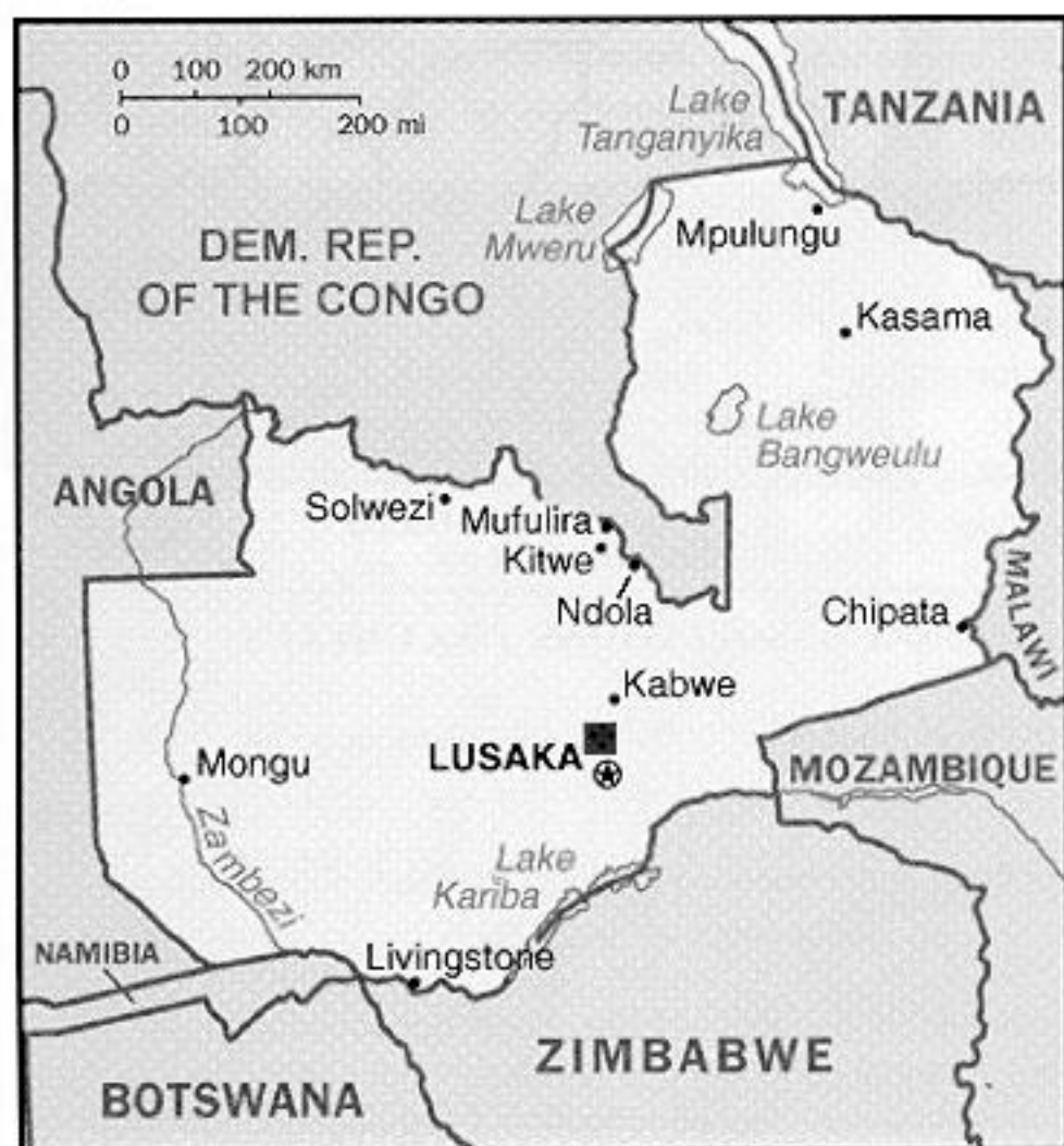
Map of Zambia

The collection in the library is very good; in fact, I believe it is one of the best theological libraries in Southern Africa. The collection consists of approximately 13,000 volumes of books, periodicals, and videos primarily focused on the subject of theology and religion. Most of the library collection was obtained, not through purchases, but through the personal gifts and donations of departing or retiring missionaries.